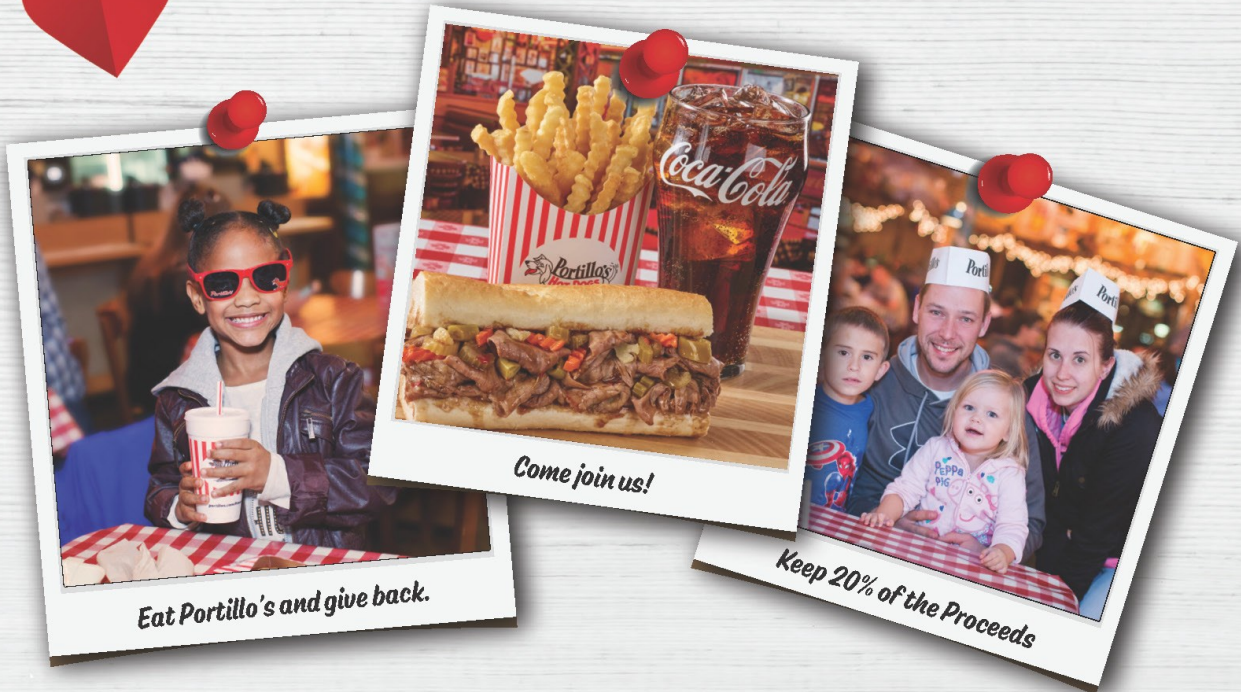
Eat Portillo's and give back.